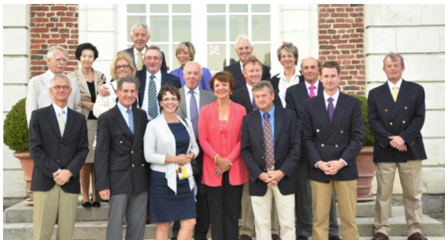
President's Cup Lille 2011