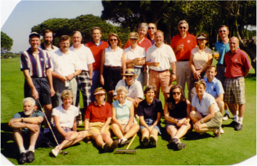
Jerez, Spain 1999