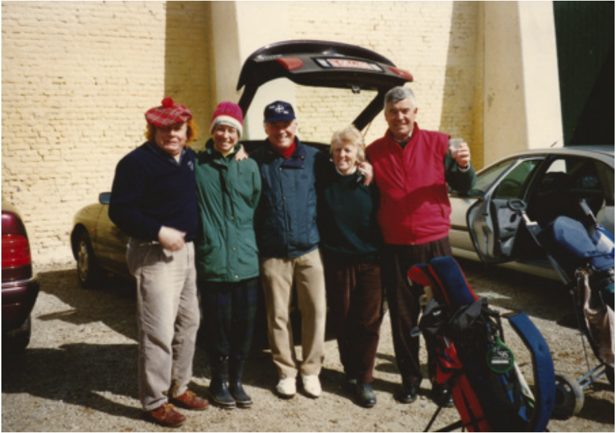
Winter golf prep