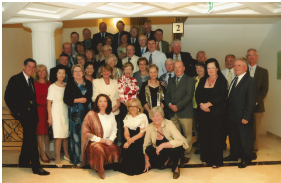
Belek Group 2012