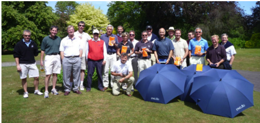
ING Competition 2011