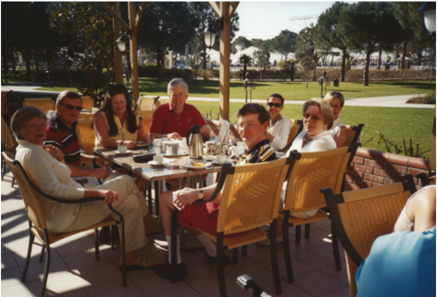
Terrace at Nobilis