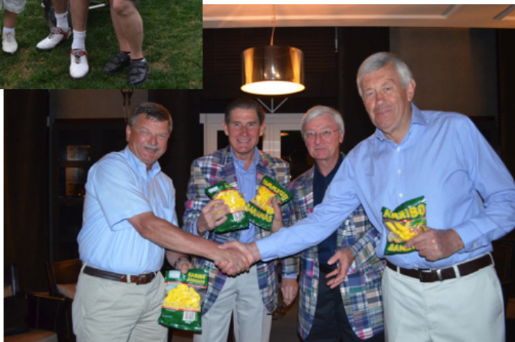
Yellow Ball winners & Presidential Technicolour Dreamcoats