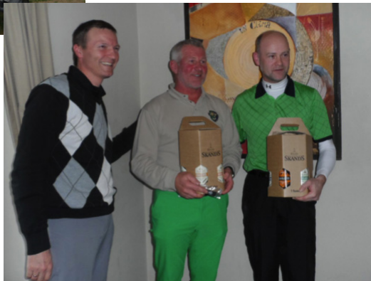
Danish sponsors (and winners!)