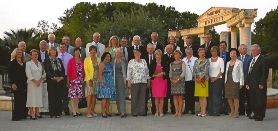
Belek Group 2014