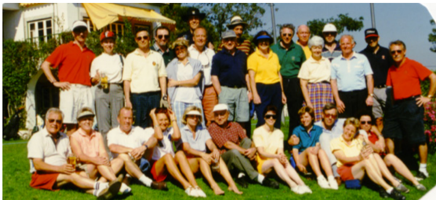
Estoril, Portugal 1997

In 1996 the Club Committee decided to organise an annual trip for club members in addition to monthly fixtures. The first trip was to the Algarve in southern Portugal in March 1997, followed in subsequent years by trips to Cascais, Portugal on three occasions in 1998, 2001 and 2002. Trips were also made to Spain near Cadiz in 1999 and to the Malaga area in 2000. There was no trip organised in 2003 but some members made a preliminary reconnaissance to Belek, Turkey.