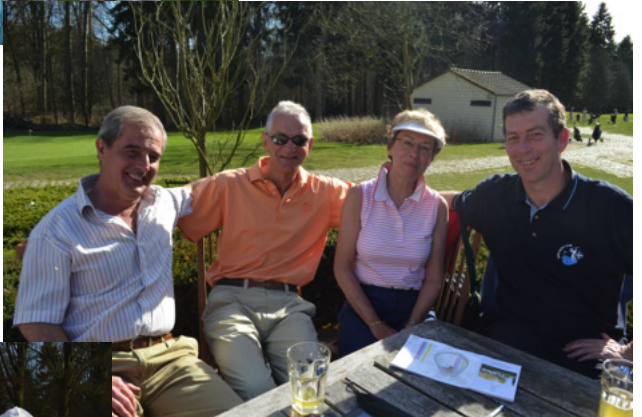
Nations' Cup Sponsors!