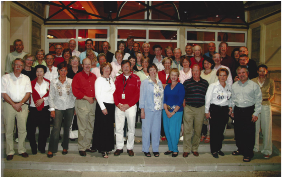
Belek Group 2007